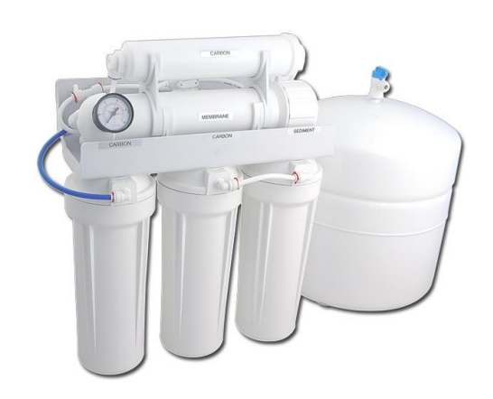
R-75 Reverse Osmosis Unit